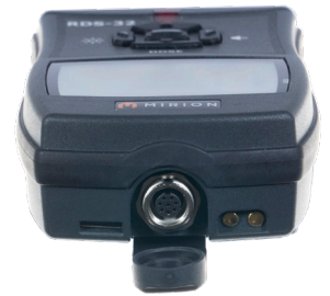
Connector, charging contacts, fixing lug for wrist strap