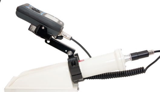
RDS-32 + SAB-100™ Alpha/Beta Probe