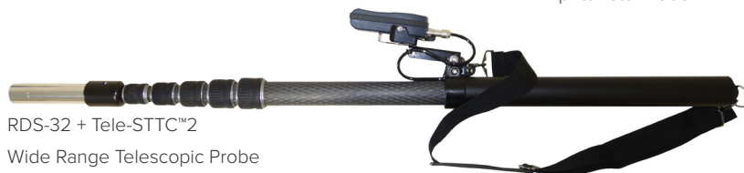
RDS-32 + Tele-STTC™2 Wide Range Telescopic Probe