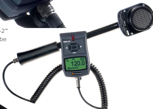
RDS-32 + GMP-25™ Alpha/Beta/Gamma Probe