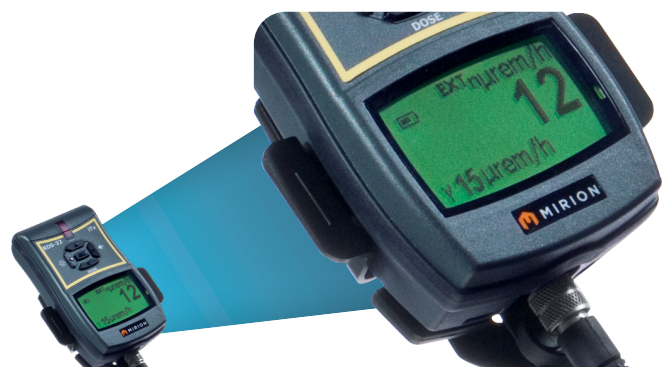
RDS-32iTx + SN-D-2™ Neutron Dose Probe